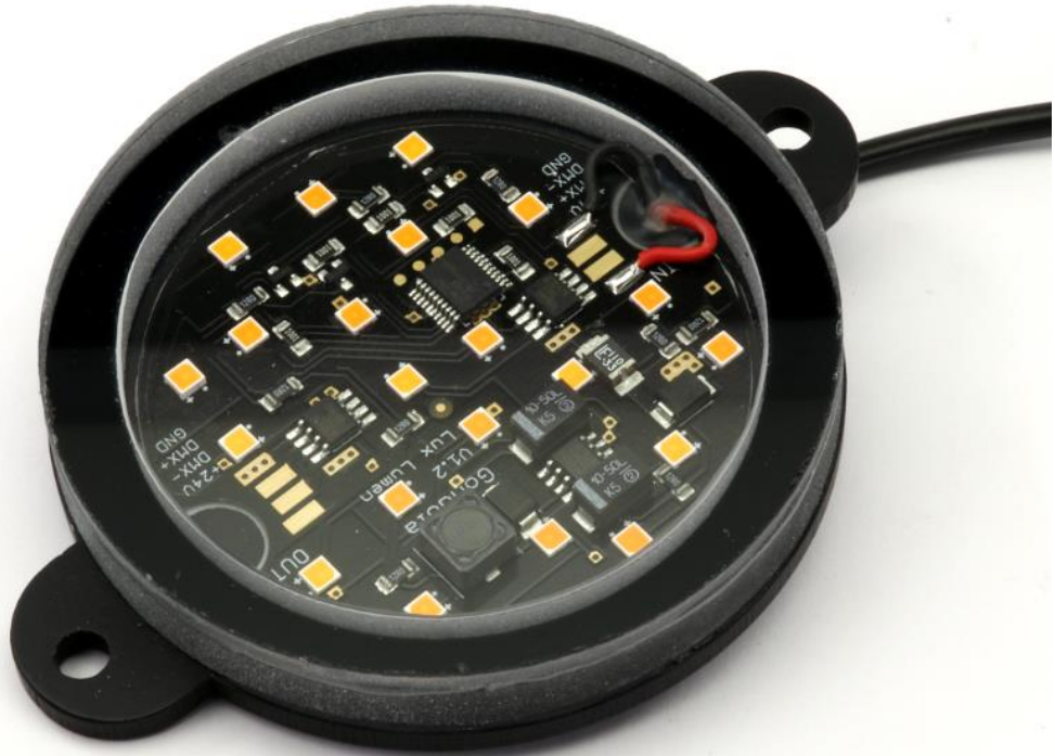
Photo TwinkleEye led module